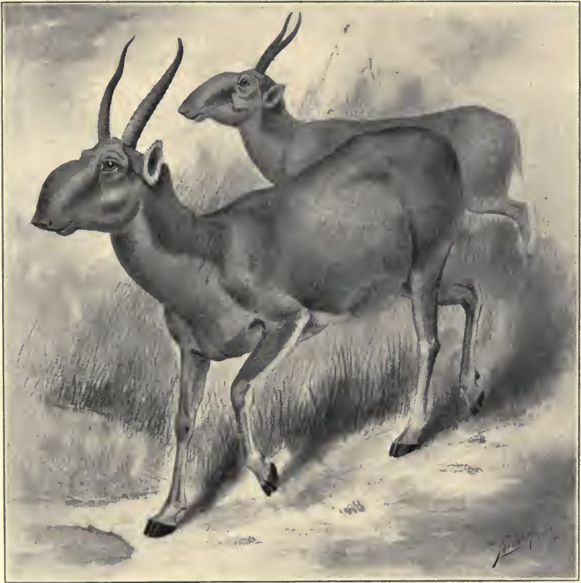
FIG. XV. SAIGA TATARICA. SAIGA ANTELOPE.